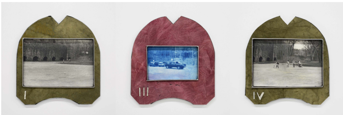
The Risk of Being Left Behind, 2017

And there was this really charged, kinetic feeling because of the crassness or rawness that can happen when you're working with your community members and it feels really safe—this queer female-bodied version of shop-talk, relative to these really strenuous material things we were doing. That's why I love working with metal, because it's so much more like the body than wood or any other material.