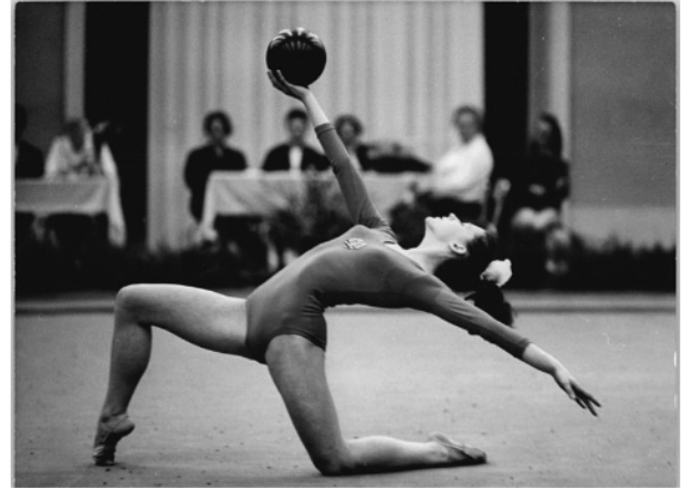
Darknessphoto.com 10/12/07 09:41:21 Foto: Schöner, Hans-Joachim, 15. Dezember 2003

Rian: espically since the cell has so much to do with water too